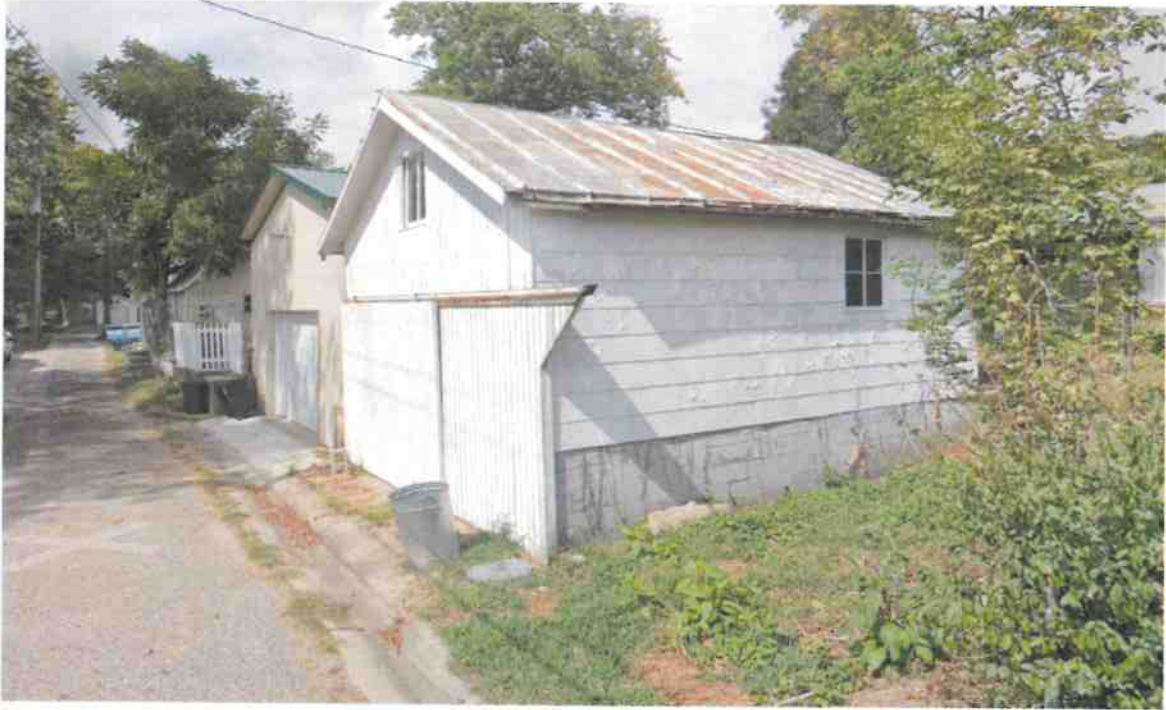
1209 & 1207 West Main Street Madison IN 47250 (Neighbors towards East)